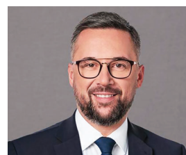
Marcin Kulasek Minister of Science and Higher Education