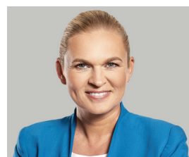
Barbara Nowacka Minister of Education